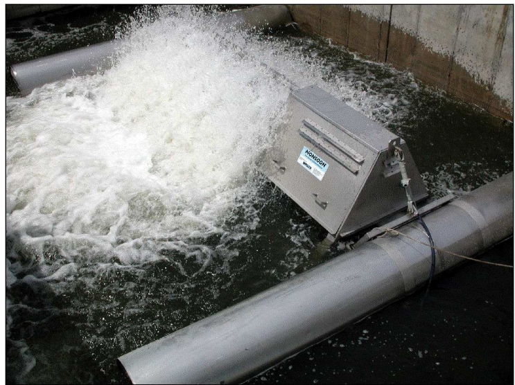
Typical 15 Hp (11.5 KW) MONSOON